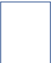
Vacant Private Sector Representative