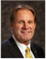
Senator Rick Billinger Senate Ways & Means