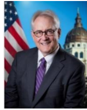
Senator Tom Hawk Senate Ways & Means