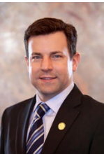
Senator J.R. Claeys House Representative