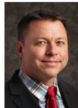
Senator Jeff Pittman Senate Representative