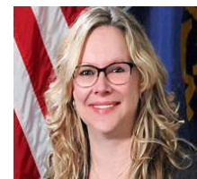
Amber Shultz Kansas Department of Labor