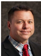
Senator Jeff Pittman Senate Representative