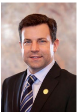
Senator J.R. Claeys Senate Representative