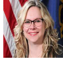
Amber Shultz Kansas Department of Labor